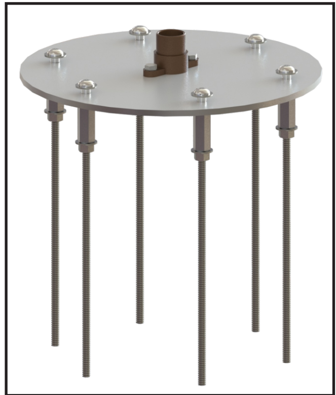
☐ Option: -IAP

Anchor plate shall be installed before concrete slab is poured. Column shower shall be mounted on top using vandal resistant mounting hardware provided.